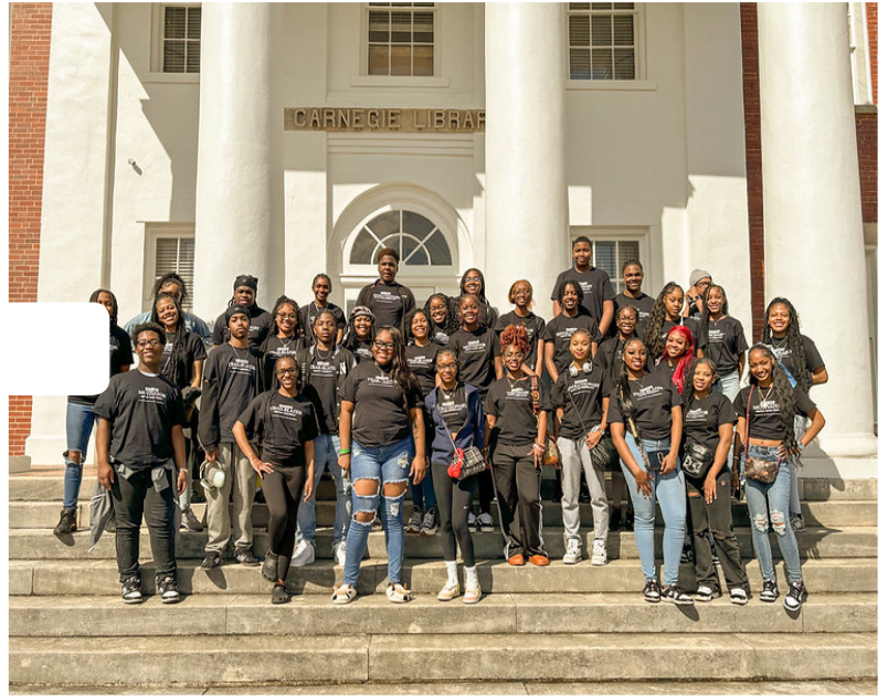
CELEBRATING FRIENDSHIP, GROWTH, AND UNFORGETTABLE MEMORIES ON OUR JOURNEY!

This year's spring break tour was truly a once-in-a-lifetime experience for our students. Together, they traveled to Kentucky State, Alabama A&M, Wilberforce University, Central State University, Fisk University, and Vanderbilt University, each stop offering its own unique charm and lessons. Long hours on the bus brought students closer to one another and to alumni from 3Seeds, fostering deep connections and shared memories. Students embraced the occasion by dressing in their finest for a formal dinner, savoring local dishes, and showcasing their talents during our annual talent show. Staying in cozy cabin lodges added an extra layer of adventure, creating a home-away-from-home atmosphere. Most importantly, this trip provided our 2024 seniors with a beautiful send-off, filled with laughter, learning, and the promise of future possibilities. The bonds formed, the schools visited, and the experiences shared will remain with them for years to come, as they carry these memories into the next chapter of their lives.