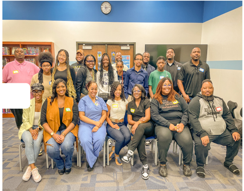
GROUP PHOTO WITH OUR PROFESSIONALS AND OUR UPWARD BOUND STUDENTS!

We are expanding our network! Our Upward Bound students got the opportunity to meet a variety of different professionals to help gauge their career trajectory. They were able to meet professionals who work in fields anywhere from nursing, health care management, mental health, engineering, transportation management, Police officers, and Entrepreneurs forging meaningful connections and an opportunity of a lifetime. This event was held for all of our students who wanted to explore their career possibilities before making a decision and committing to a college or university that offers that major. Our Upward bound students brought their interesting questions to ask the career professionals. We created a speed chat activity where students asked questions to each professional for about 7 minutes and rotated to the next professional. The students were so engaged and left feeling inspired and motivated to take the next step in their academic journey.