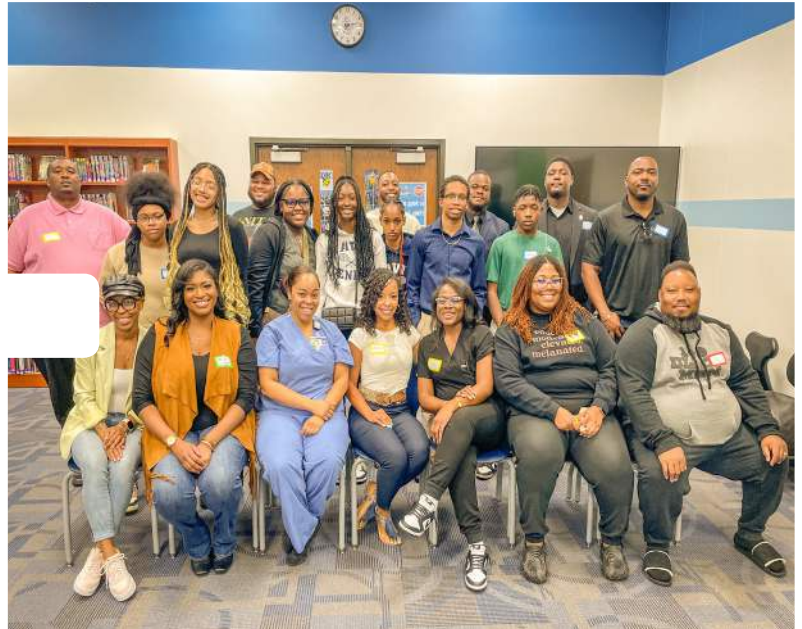
GROUP PHOTO WITH OUR PROFESSIONALS AND OUR UPWARD BOUND STUDENTS!

We are expanding our network! Our Upward Bound students got the opportunity to meet a variety of different professionals to help gauge their career trajectory. They were able to meet professionals who work in fields anywhere from nursing, health care management, mental health, engineering, transportation management, Police officers, and Entrepreneurs forging meaningful connections and an opportunity of a lifetime. This event was held for all of our students who wanted to explore their career possibilities before making a decision and committing to a college or university that offers that major. Our Upward bound students brought their interesting questions to ask the career professionals. We created a speed chat activity where students asked questions to each professional for about 7 minutes and rotated to the next professional. The students were so engaged and left feeling inspired and motivated to take the next step in their academic journey.