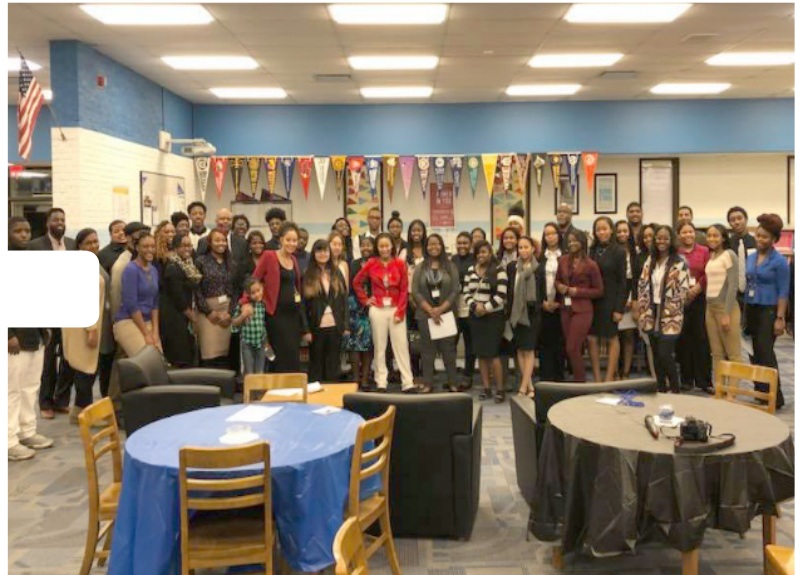
CHICAGOLAND PROFESSIONALS AND UPWARD BOUND STUDENTS POSE DURING THE PROFESSIONAL NETWORKING MIXER.

On Thursday, February 22nd, 2018, 3 Seeds Mentoring Group's Upward Bound students had the opportunity to practice their networking skills by speaking with prominent professionals from across the Chicagoland area. The purpose of the networking event was to exchange of information, and advice via an informational interview process that assisted the students in attaining future goals and careers. Prior to the mixer, students attended workshops in efforts to prepare for the event. Making the most of their conversations and learning ways to manage their nerves associated with meeting new people, the students acquired information to successfully navigate the event. Students were eager to mingle with professionals who worked in the fields of education, marketing, medicine, publishing and more. During the Networking Mixer, students retrieved contact information and business cards from knowledgeable professionals who are all well respected in their fields, who were open and willing to share and contribute to the advancement of the students.