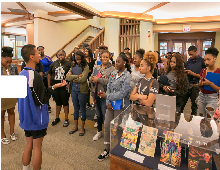
UPWARD BOUND STUDENTS ON A COLLEGE VISIT TO DEPAUL DURING THE 6 WEEK SUMMER PROGRAM.

Upward Bound's first summer enrichment academy. Over 40 Upward Bound scholars spent an average 25 hours per week learning about college success while creating vision and memories with their peers. On the campus of Governor State University, students were introduced to college through mock lectures and activities like course schedule development. Each week provided a different focus to present students with the opportunity to explore and engage beyond the classroom. Outside of the primary location of GSU, students visited Indiana University- Bloomington, Ball State University and Depaul University. During the college visits students were able to put the learned lessons into action by asking questions and obtaining information on topics like retention, campus involvement opportunities, financial aid, scholarships and more. From vision boards to strength assessments to video projects, the exposure and experience was fun yet noteworthy. The days began and ended with online assessments containing questionnaires, writing prompts, daily quotes for discussion and SAT vocabulary words. After a summer of hard-work and dedication, the most active and high performing students were invited to a summer tour to Washington D.C., read more about the UB scholars taking on D.C. on page two.