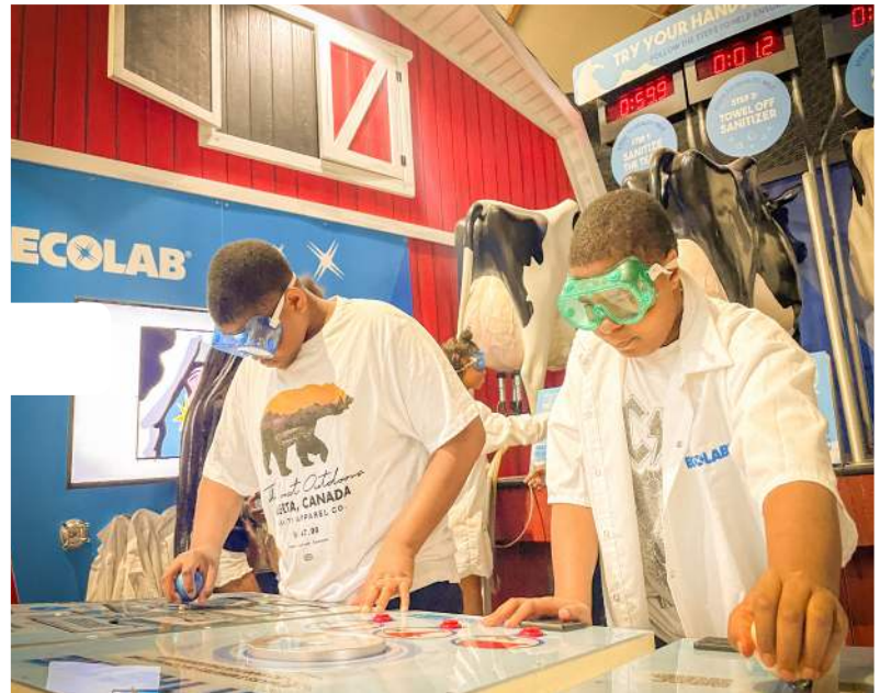
SOUTHWOOD STUDENTS USING A SIMULATOR RIGHT BEFORE THE DAIRY TOUR IN THE MAIN BUILDING

Our planet is ever-changing right? Well our Southwood students received the chance to witness it first hand on farmland. 3 Seeds hosted our annual trip to Fair Oaks Farm located in Fair Oaks, Indiana. The goal of this field trip was to enlighten students with an enriching & experiential learning experience. During this visit, the students were taken on three different tours. First, the students were taken on “The Dairy Adventure” where they saw where the cows lived, ate, slept, and how they were milked by the robotic machines. The students gained knowledge of how the cows contributed to society and the importance of their sustainability. Next, “The Pig Adventure” showed the students all about the life of a pig. They also learned all about pork and its benefits and discovered the growth cycle of pigs. Lastly, “The Crop Adventure” showed the students how crop farming starts as a small seed in order to feed a world of about 7 billion people and more.